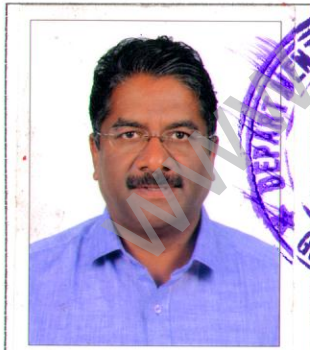
Photograph of RQP

This recognition is valid for a period of 10 years ending 22/02/2028