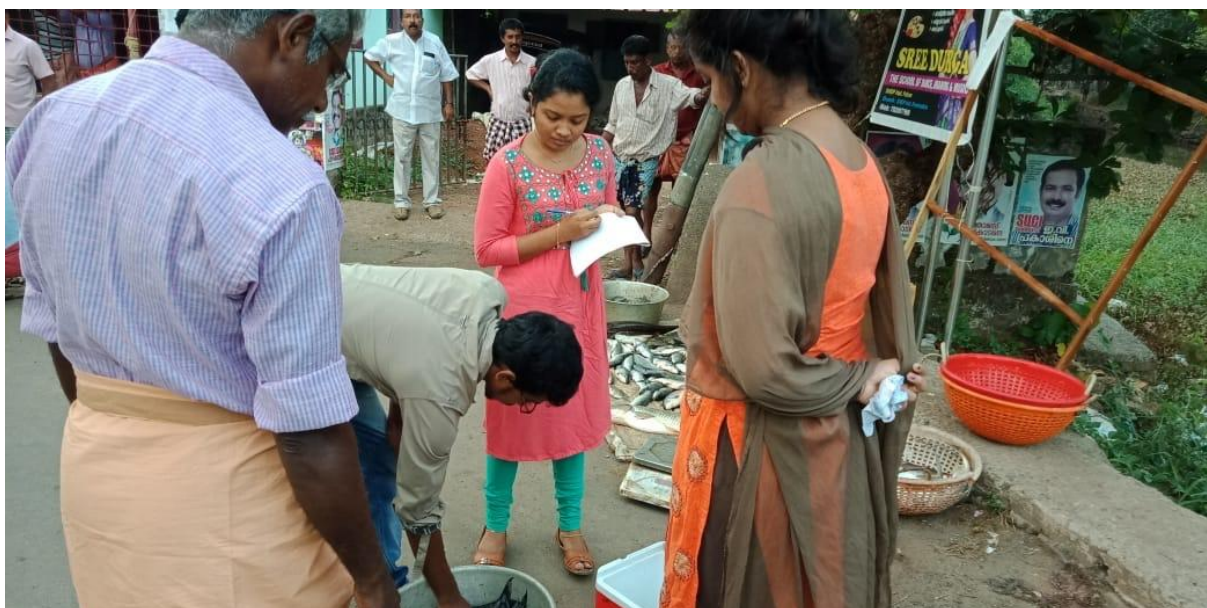
KUFOS Study Team at a local fish market

https://www.thehindu.com/news/national/kerala/floods-imperil-western-ghats-ecology/article24813448.ece