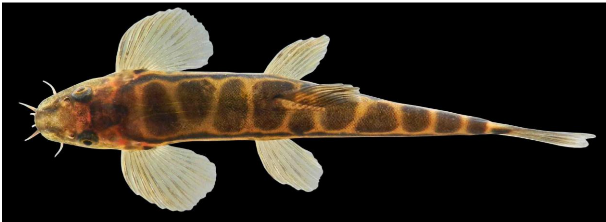
Ghatsa santhamparaiensis , an endemic and a Critically Endangered species of the Santhampara Hills