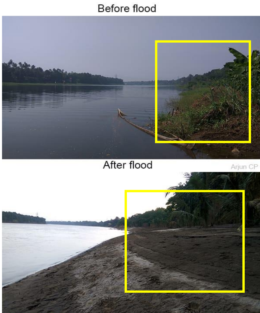
Downstream freshwater habitat in Malayatoor before and after the flood.

Shoreline vegetation and riparian cover has been significantly affected in the lower reaches of Periyar River especially in the areas around Malayatoor which were critical habitats for species such as the Malabar Puffer, Carinotetraodon travancoricus and the freshwater Pipefish, Microphis cunocalus .