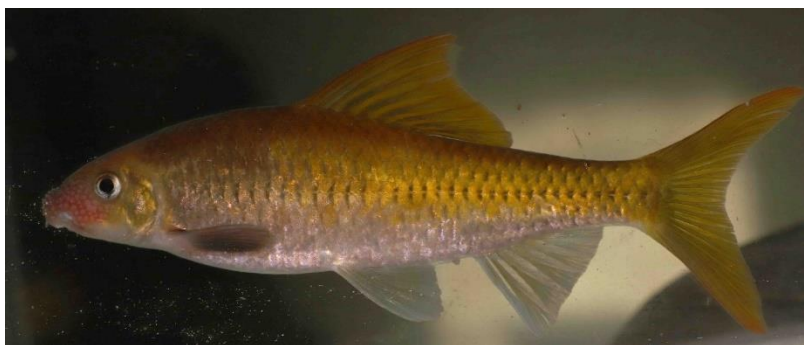
Tariqilabeo periyarensis , an endangered and endemic species of cyprinid of the Western Ghats