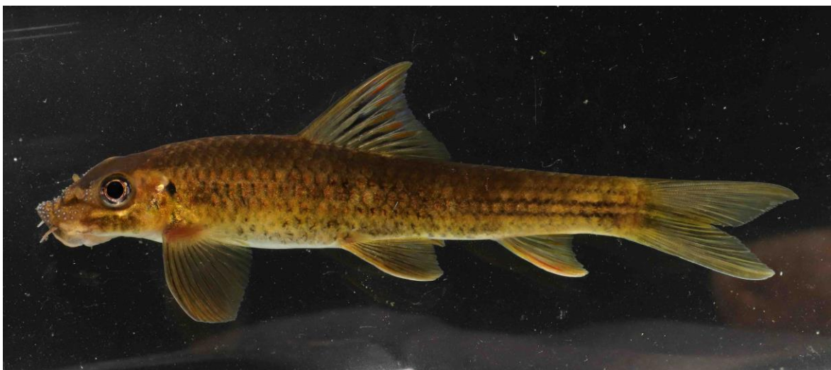
Garra mlapparaensis , an endemic species of Periyar Tiger Reserve