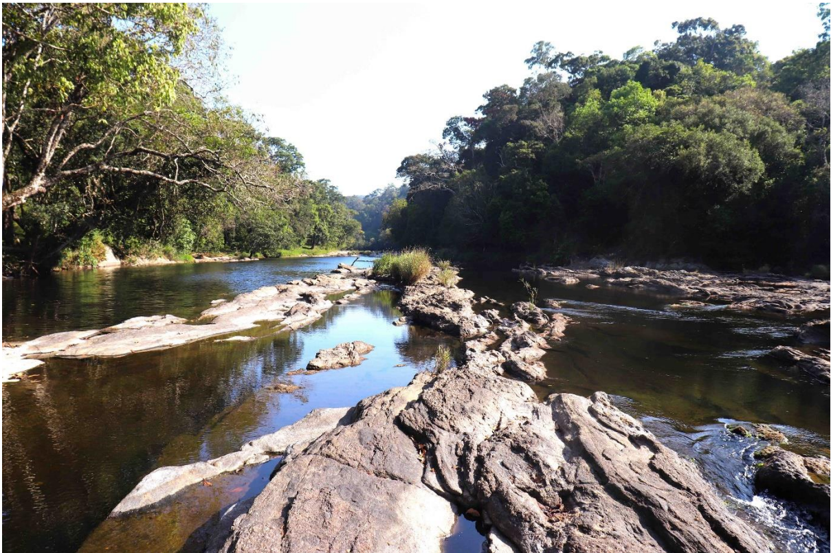
Critical freshwater fish habitats inside the Periyar Tiger Reserve