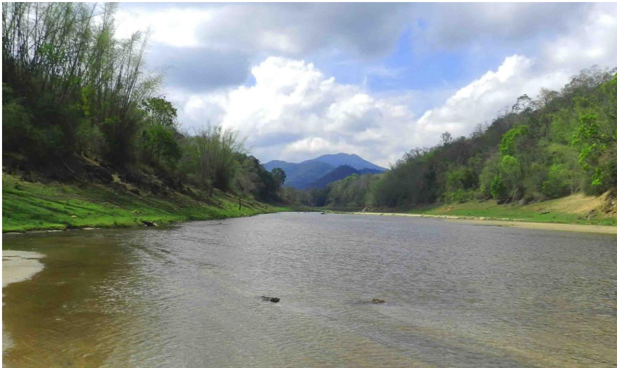
A critical fish habitat in the upper reaches of the Periyar inside the Periyar Tiger Reserve harbouring populations of six endemic species

Our studies were carried out from January 2018 to April 2019 and therefore, we do not know whether any sudden impacts had occurred subsequent to the flooding in August/September 2018. The heavy debris washed down by floodwaters could have displaced some endemic fish species from their habitat, but all populations seem to have shown resilience and their populations have no doubt rebounded.