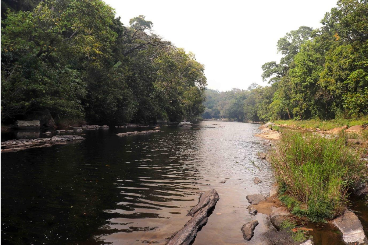
Critical freshwater fish habitats inside the Periyar Tiger Reserve