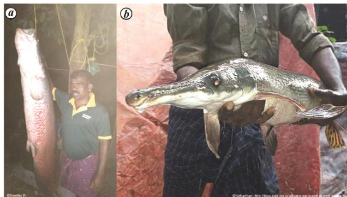
Figure 1. a, Arapaima caught from the Kodungalloor backwaters after the 2018 floods. b, Alligator gar caught from the Kurumali River.

Both arapaima and alligator gar are illegally introduced into India as they do not figure in the indicative list of 92 ornamental fishes considered for import 22 . In addition, arapaima being listed in the Schedule II of CITES, has been specifically prohibited for import into the country 22 . In Kerala, the 'use of non-domestic fish and fish seeds for fish farming without subjecting them to quarantine proceedings and quality check' has been prohibited through the Kerala Inland Fisheries and Aquaculture Act, 2010, while the Kerala Fish Seed Bill, 2014 demands strict quarantine measures for introduction of any non-native fish into the state. Nevertheless, lack of mechanisms for implementing and enforcing these provisions facilitates the illegal farming of top predators like arapaima and alligator gar in Kerala. Their culture, exhibition and sale continue unabated through public aquarium shows, social media and e-commerce enterprises. Interview and promotion videos of ornamental fish farmers and farms available in the public domain (including several on YouTube TM ) reveal that the fingerlings of