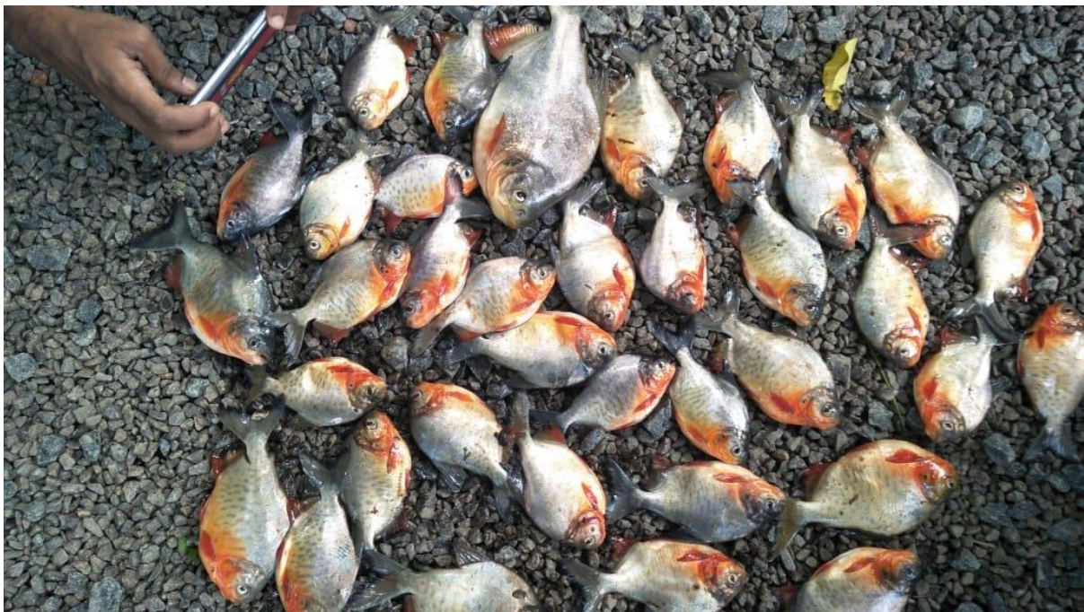
Pacu, Piaractus brachypomus specimens caught from the Vembanad Lake

Only 92 species of ornamental fish are legally allowed to be imported to India, of which 79 are of freshwater origin (Government of India http://aqcsindia.gov.in/pdf/trade-14.pdf ). But, the aquarium pet industry and associated breeding and farming sector in the WG region is largely unregulated and have been implicated in several conservation issues (see Raghavan et al. 2013; Krishnakumar et al. 2009). Of the seven species that were recorded for the first time from the WG subsequent to the floods, many are illegally introduced and farmed for the aquarium pet trade, as they are not listed in the species allowed to be imported to the country. These included large-bodied and high-risk species such as the Arapaima ( Arapaima gigas ) and Alligator gar ( Atractosteus spatula ), top predators capable of feeding on a range of organisms and a serious threat to the endemic fish diversity of the WG region (Biju Kumar et al. 2019). Although not yet recorded from the wild, questionnaire surveys and personal communication with ornamental fish farmers reveal that additional species such as the Arowana ( Scleropages spp.), shovelnose catfish ( Pseudoplatysoma sp.) and Redtail Catfish ( Phractocephalus hemiliopterus ) have also escaped from rearing facilities in the region. Most breeding and farming units for aquarium fish in the WG region have no biosecurity systems, and function along the floodplains of major rivers that are vulnerable to annual flooding events, including ECEs.