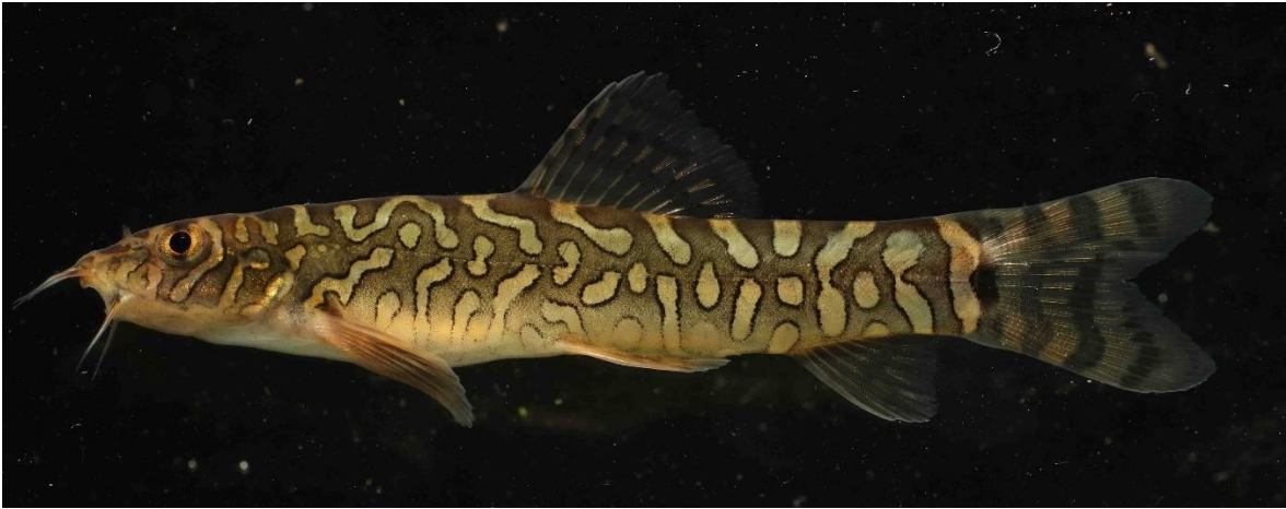
Mesonoemacheilus periyarensis , an endemic species of Periyar Tiger Reserve