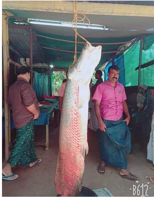
Arapaima gigas recorded from Kodungaloor backwaters after the floods