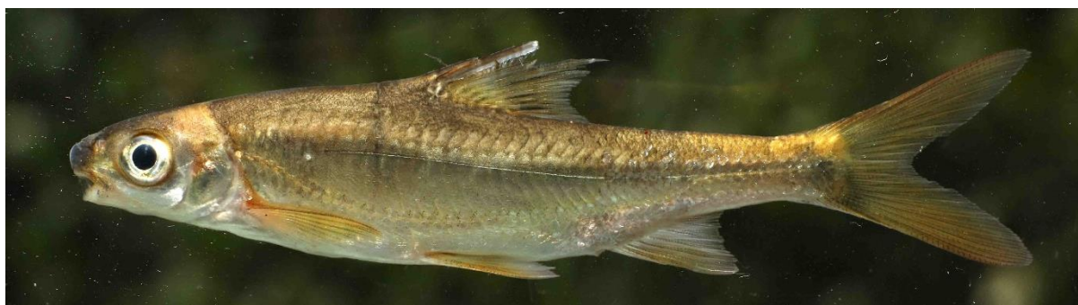
Lepidopygopsis typus , an endangered and endemic freshwater fish of Western Ghats found only in the Periyar Tiger Reserve

Catch per effort calculated as catch of the species obtained in 5 continuous cast nettings* and 5 scoop net operations at a habitat