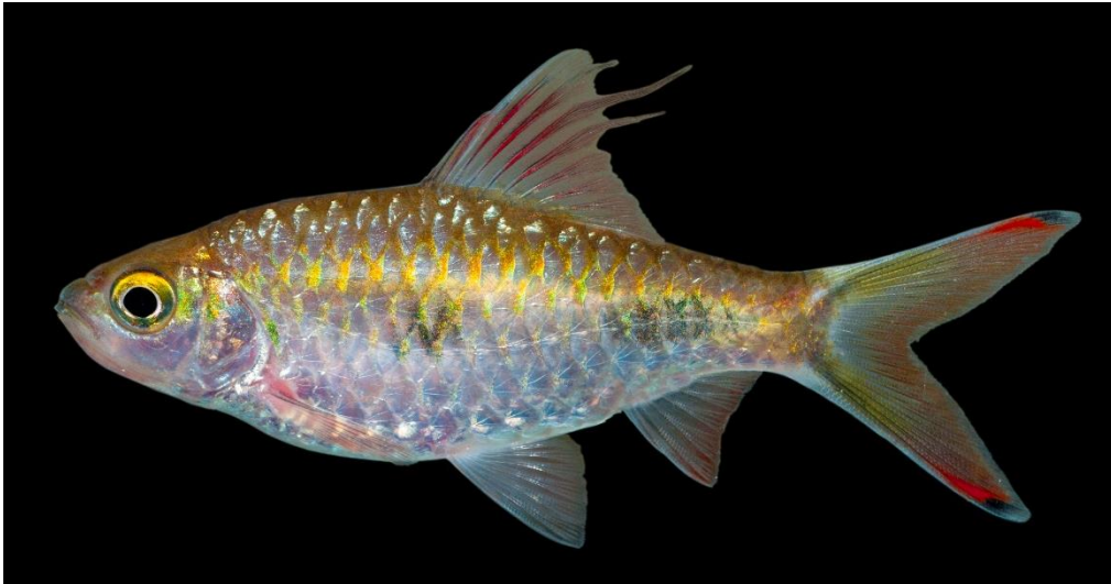
Dawkinsia exclamatio , an endemic species of the Kallada River