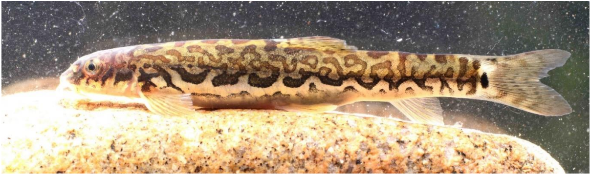
Mesonoemacheilus menoni , an endemic species of Periyar Tiger Reserve