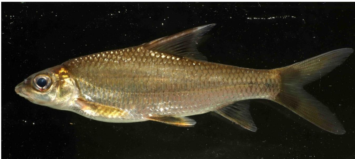
Hypselobarbus periyarensis , an endemic species of Periyar Tiger Reserve