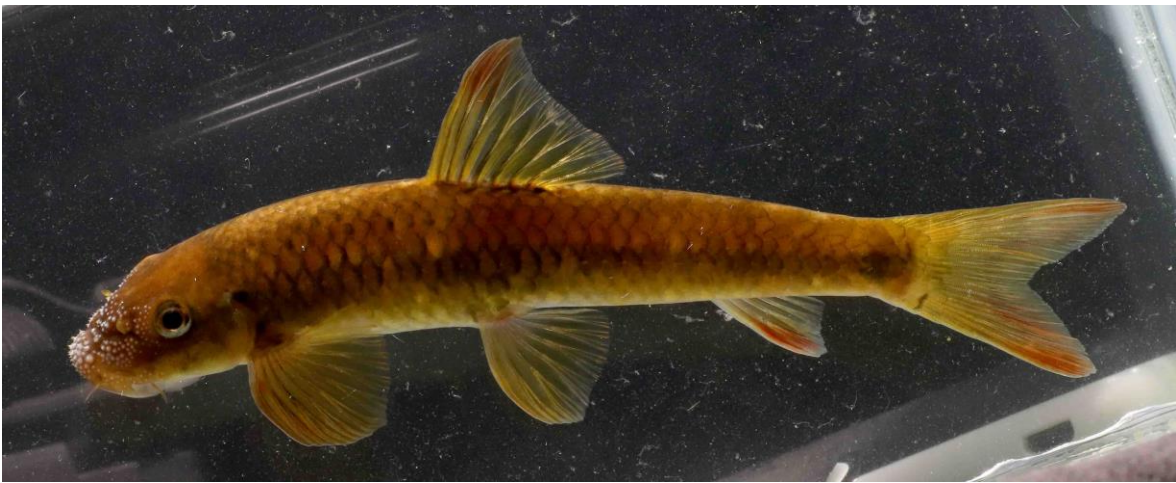
Garra periyarensis , an endemic species of Periyar Tiger Reserve