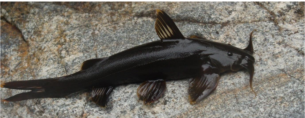
Glyptothorax davissinghi , an endemic fish species of New Amarambalam Reserve Forest