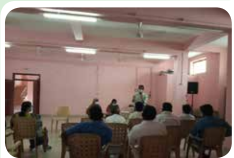
Meeting of traders of traded bioresources held at Kozhinjampara GP. Palakkad