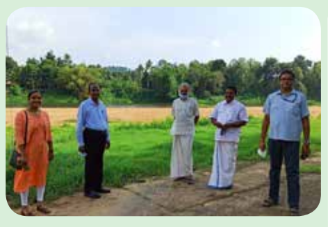
Field visit at Ayiroor GP for Biodiversity park/interpretation centre