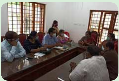
BMC meeting at Ranni Angadi GP