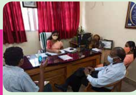
Meeting at Kozhenchery GP